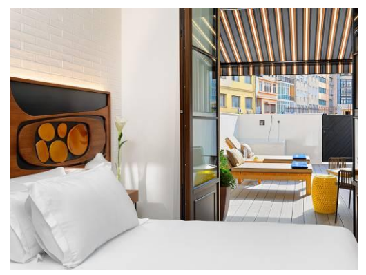
DELUXE DOUBLE ROOM WITH TERRACE

Superior Double Rooms with terrace: rooms with a double bed or twin beds. They have a pleasant furnished terrace with views of the hotel's pool and an interior patio that is typical of Barcelona's Eixample district. Possibility of connecting rooms, ideal for families.