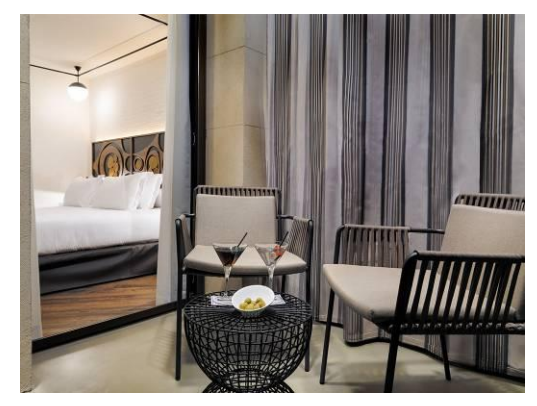
SUPERIOR DOUBLE ROOM WITH TERRACE

Rambla Double Rooms: rooms with King Size bed or twin beds. They have a balcony with views of Plaça Catalunya.