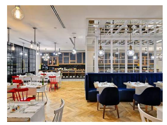
THE KITCHEN RESTAURANT

The Kitchen Restaurant: offers a delicious breakfast buffet prepared using high-quality products and a selection of freshly cooked à la carte dishes. Possibility of holding private events.